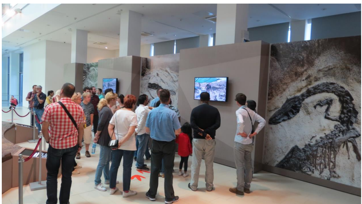
In the Centre of Natural History – Svilajnac